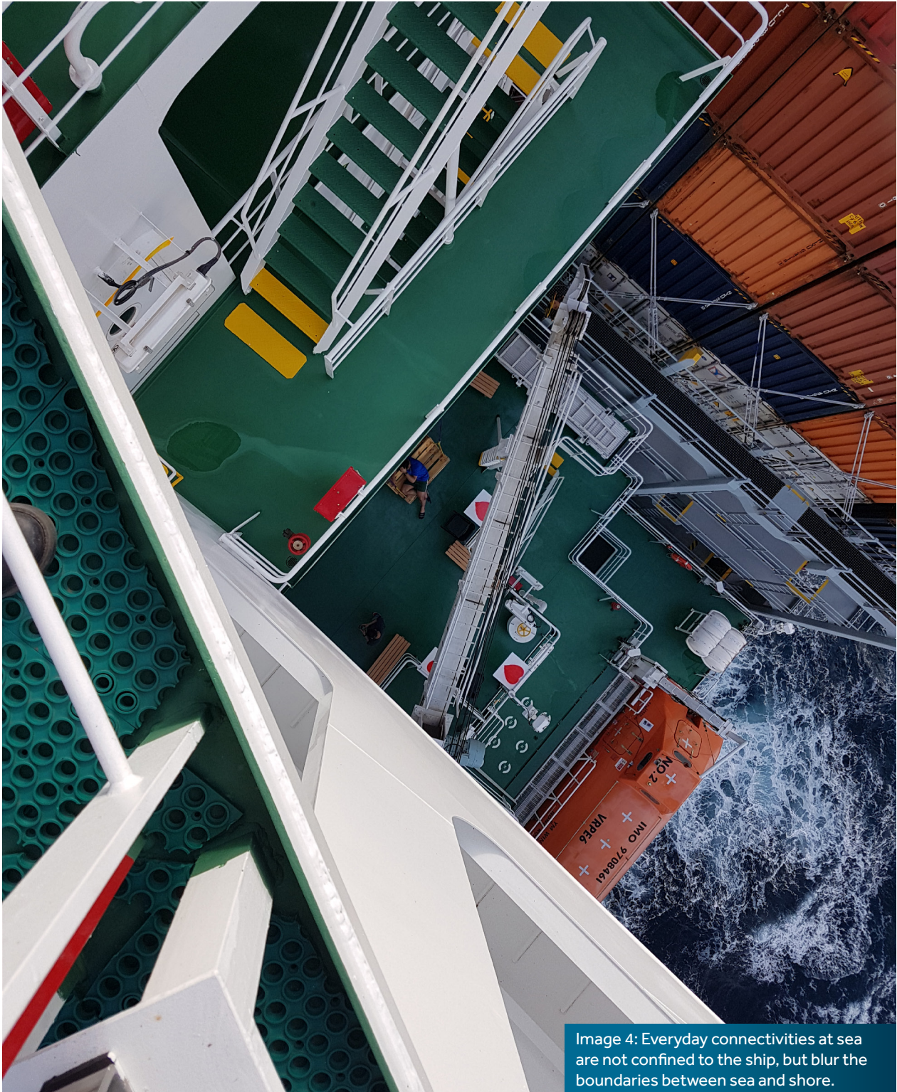
Image 4: Everyday connectivities at sea are not confined to the ship, but blur the boundaries between sea and shore.