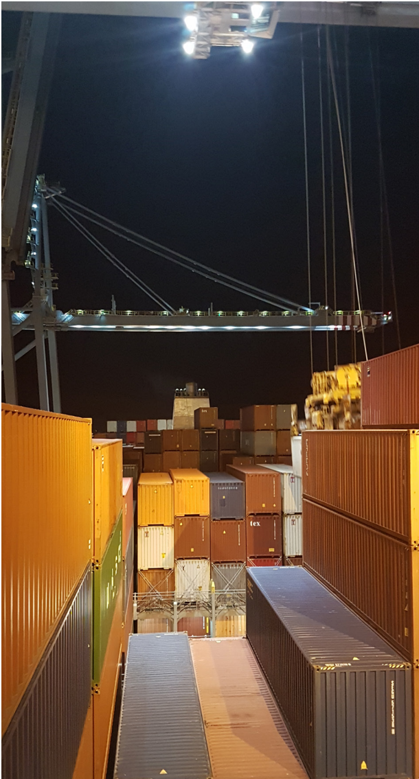
Image 5: The everyday rhythms and routines of the ship are driven by the core function of the ship; the transportation of goods across great geographical distances. Seafarer lives are lived alongside these rhythms.

Similarly, onboard Ship2, where participants had to rely on external methods of connecting, there was a culture of sharing knowledge about which sites to use in terms of reducing data consumption, which sellers to buy from and not to buy from to get the best deals on mobile phone sim cards, and in which ports to buy sim cards that would cover larger areas. For example, northern Europe was seen to be better than southern Europe and Asia because the cards covered larger areas – and not just one country (although these cards were also seen to be expensive by the crew). This culture of sharing knowledge and experience was particularly evident when new crew members joined the ship.