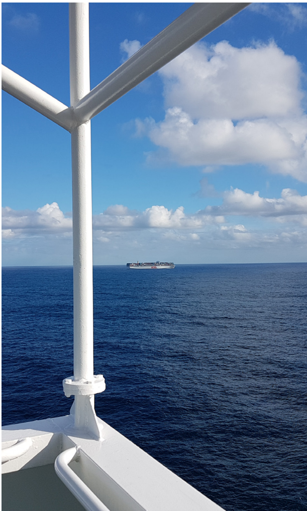
Image 6: Participants voiced a number of different pressures which were amplified by the lack of ability to connect in a frequent and reliable manner. These included financial pressures, pressures from family and friends, work pressures, and pressures from being isolated.

From a different perspective, participants also noted that if no sim card sellers turned up in a port this would have a significant impact on the mood onboard the ship. In some places it would be possible for them to go ashore to buy sim cards in port, but in other places this was not an option either because of limited time or because of security. Related to a wider culture of sharing, it was also noted that they would often buy sim cards for each other, in situations where some crew members were too busy to either go ashore or be present when the seller(s) came aboard the ship to sell sim cards.