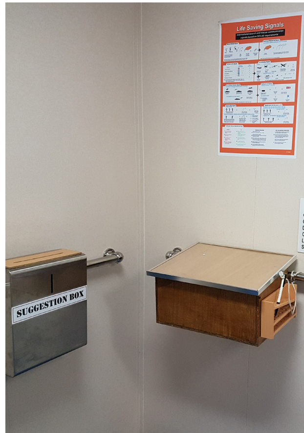
Image 8: Participants voiced a number of suggestions and put forward a series of recommendations for improving onboard connectivities, within and beyond the ship.

Limited onboard connectivity and the pressures linked to finding alternative ways of connecting were found to amplify other pressures related to work, isolation, separation, family, and money. This was exemplified by the buying and selling of mobile phone sim cards in ports.