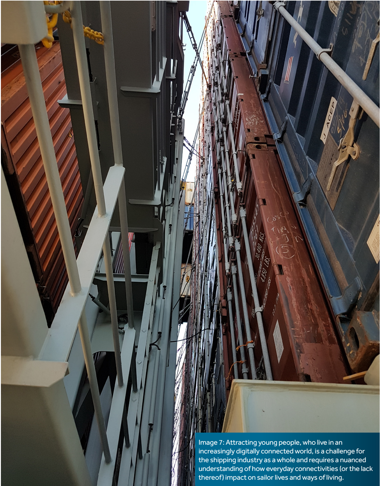
Image 7: Attracting young people, who live in an increasingly digitally connected world, is a challenge for the shipping industry as a whole and requires a nuanced understanding of how everyday connectivities (or the lack thereof) impact on sailor lives and ways of living.